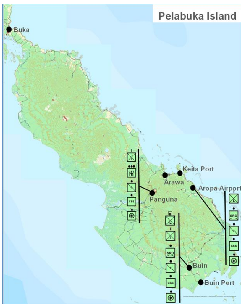
Figure 1. AO Pelabuka Island

Further reporting indicates that additional forces may be advancing to Guadalcanal Island and Honiara in the South East of the Puller Islands, however no forces have landed IVO Honiara at this time and ISR is monitoring the situation (NFI).